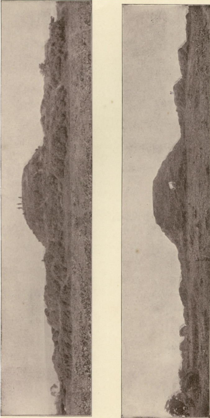
VIEWS OF MOTE AT KILFINNANE.