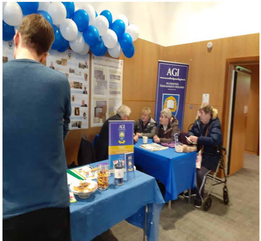
Consultation in progress