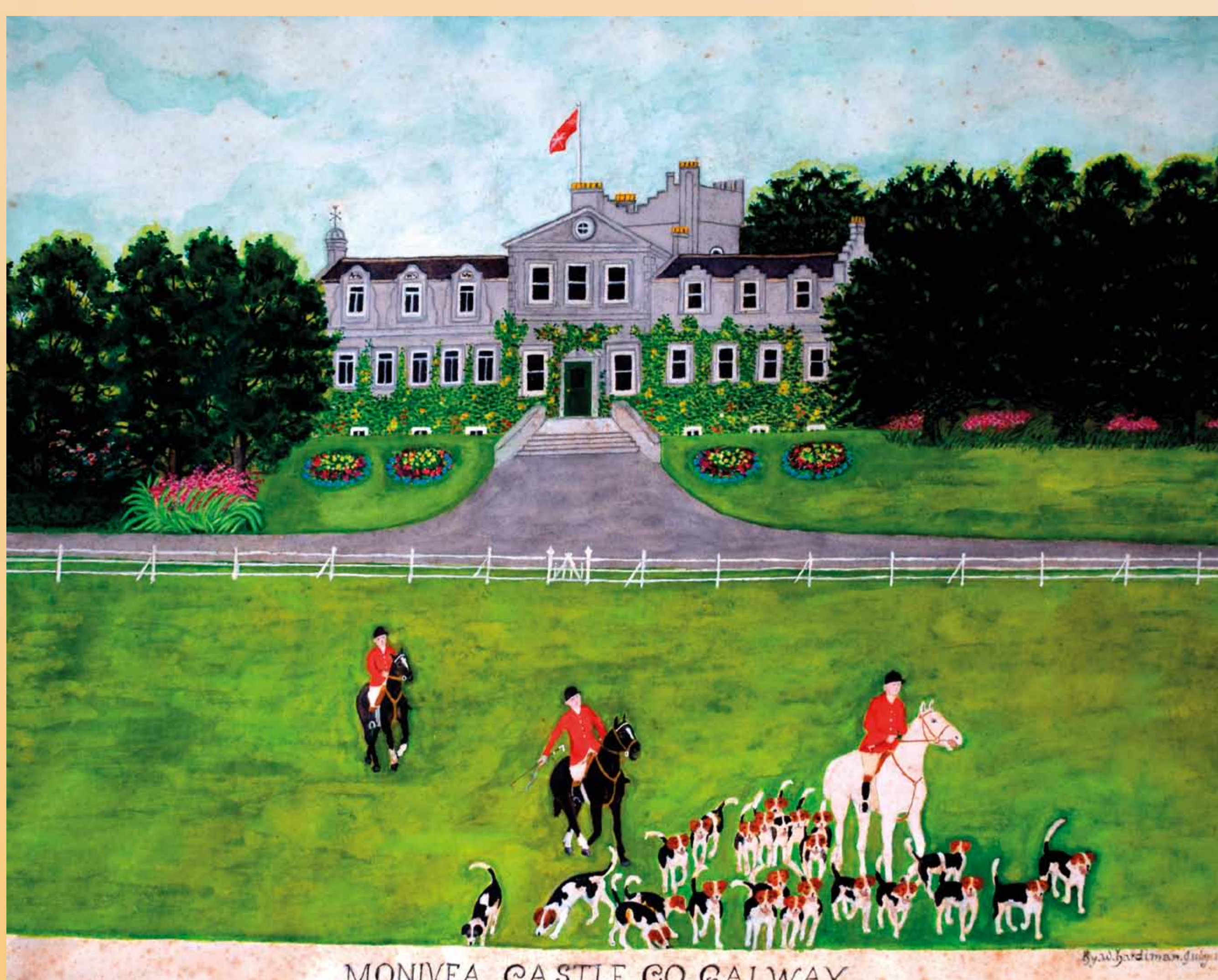
MONIVEA, CASTLE, CO. GALWAY.