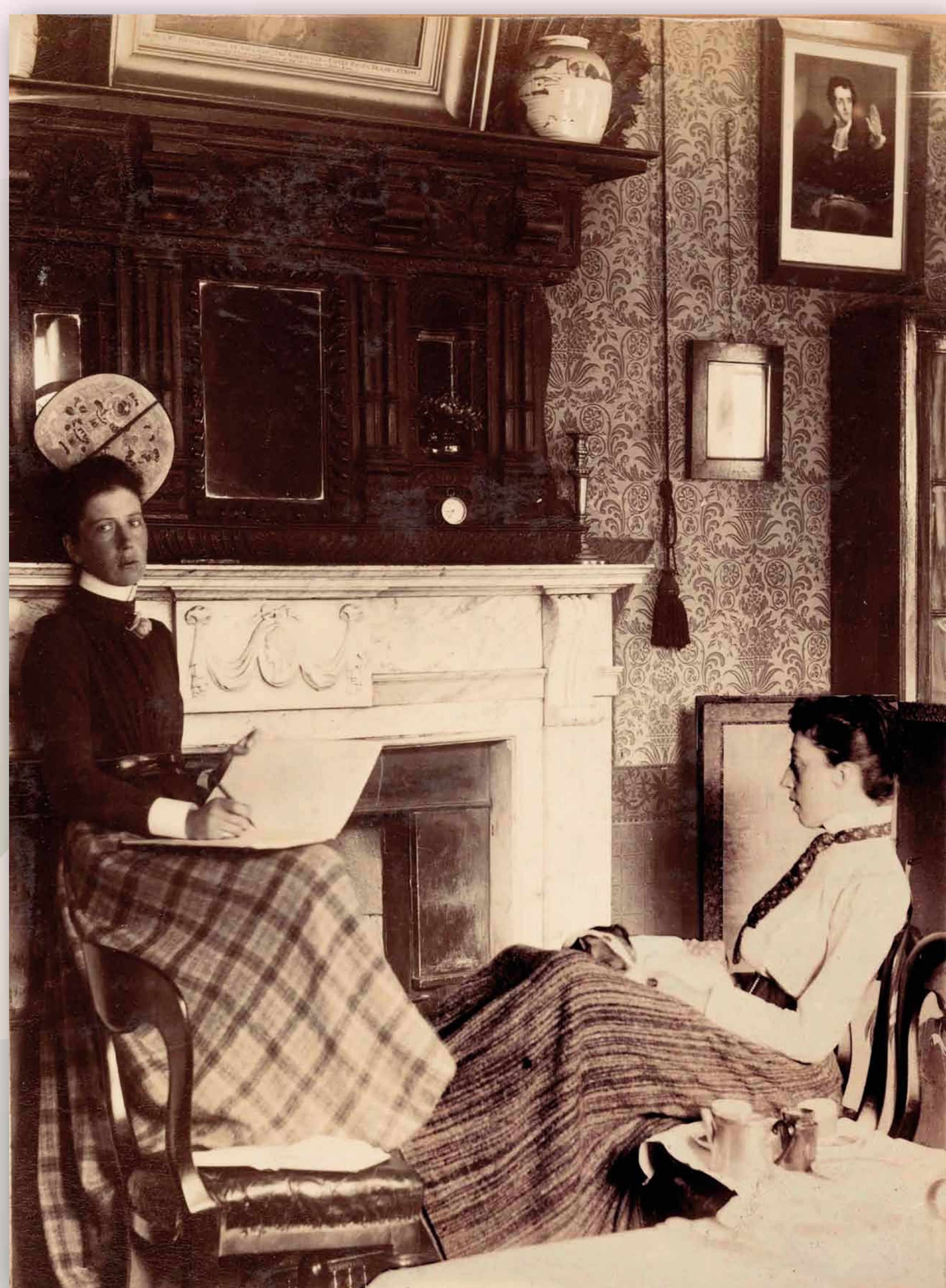
Edith Somerville (1858-1949) and Violet Martin (1862-1915)

Largely forgotten now, Violet was a committed suffragette, becoming a vice-president of the Munster Women's Franchise League.