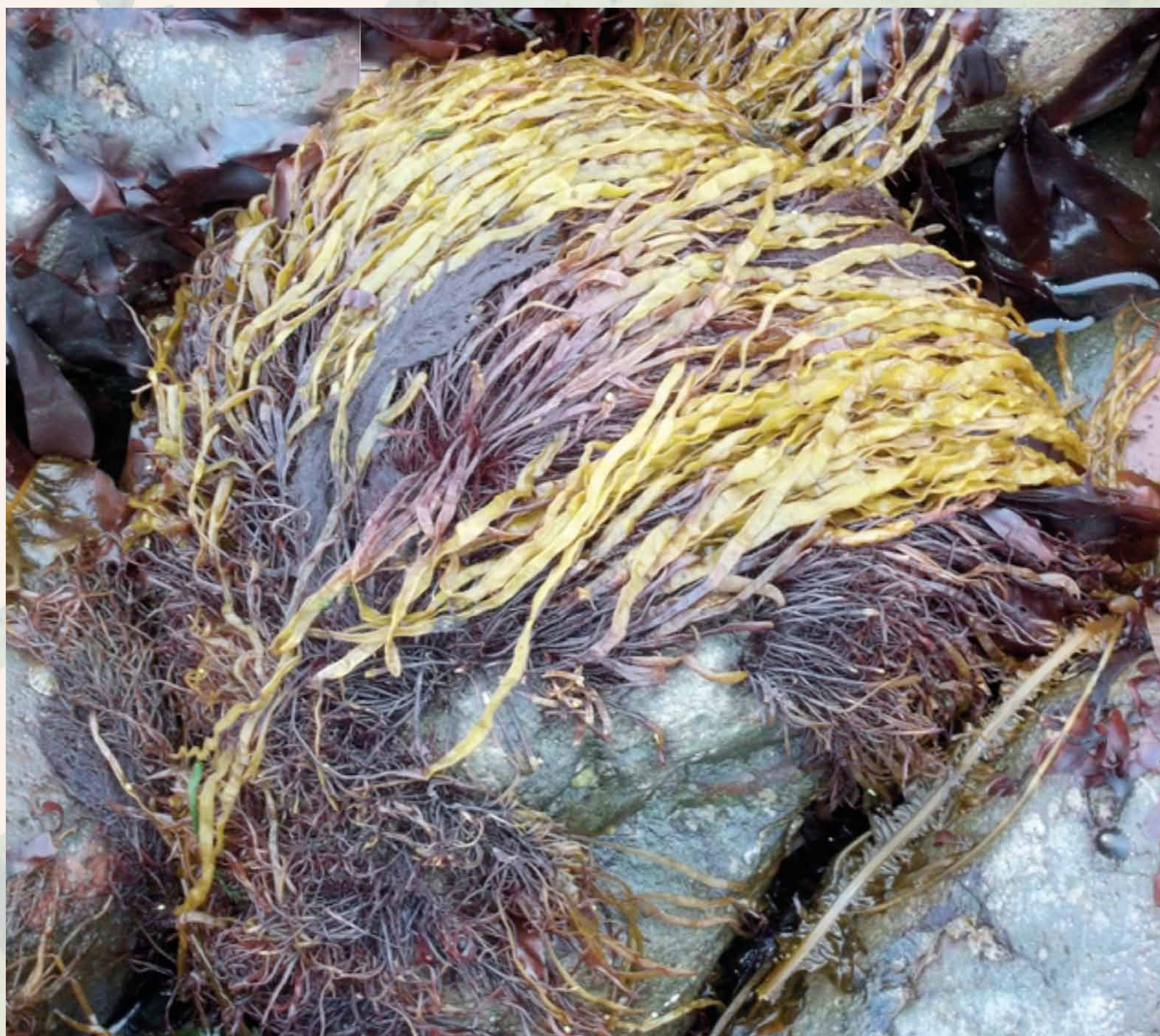
Seaweed

She obtained a PhD in 1945 based on her research on marine algae in Galway; was appointed Lecturer in Botany in 1947 and Professor of Botany from 1962 to 1977 in UCG.