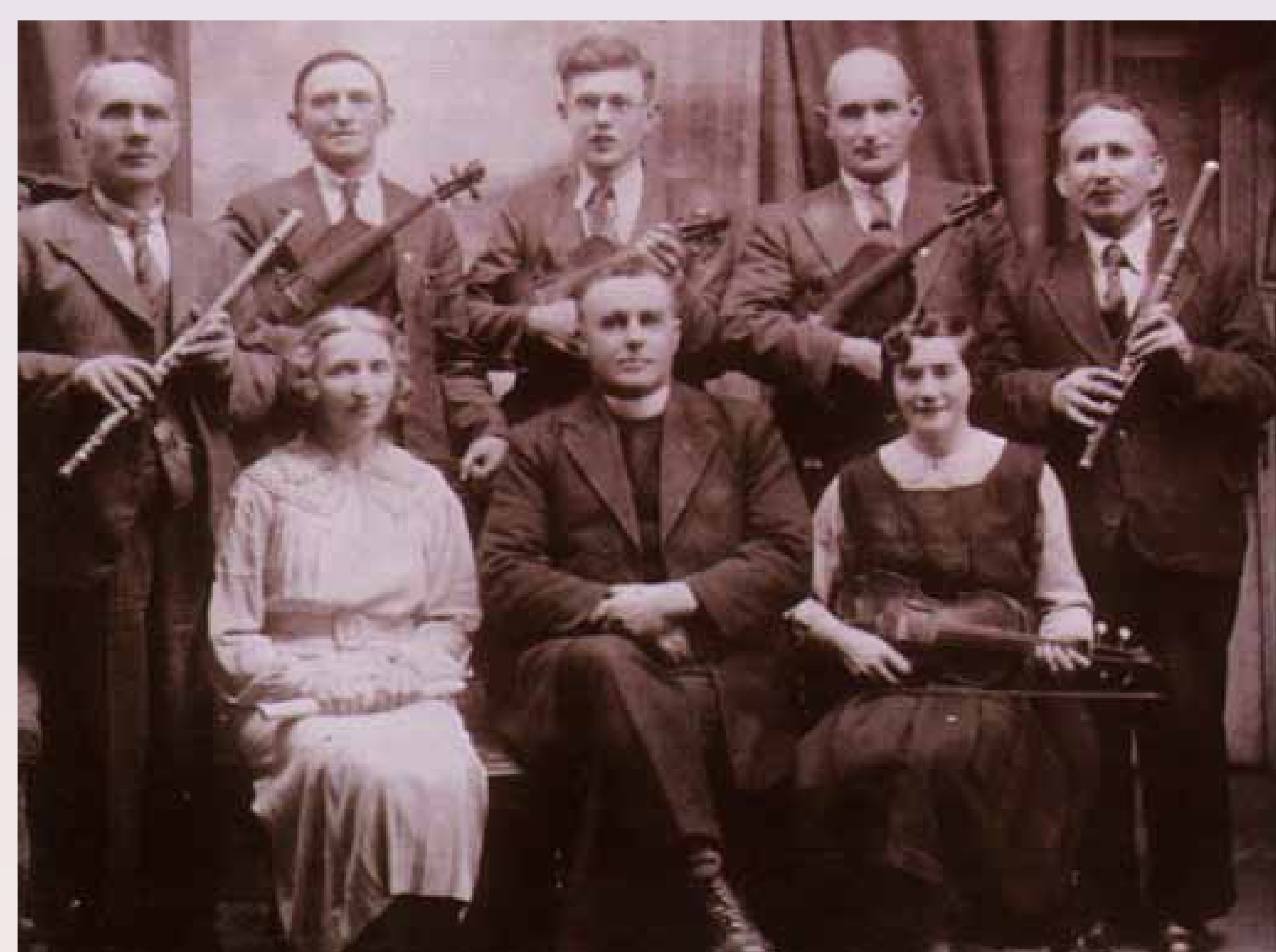
Ballinakill Ceilí Band

DESCRIBED BY SEAMUS ENNIS AS 'QUEEN OF FIDDLERS'